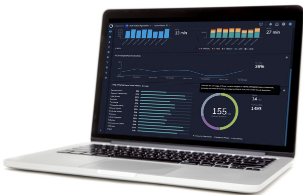
(Fig 3) Custom dashboards for provable ROI

Take advantage of direct collaboration with our skilled security analysts to help you make better response decisions and feel more secure with 24x7x365 monitoring, rapid investigation, continuous threat hunting, and two-person integrity on every action taken. (Fig 3)