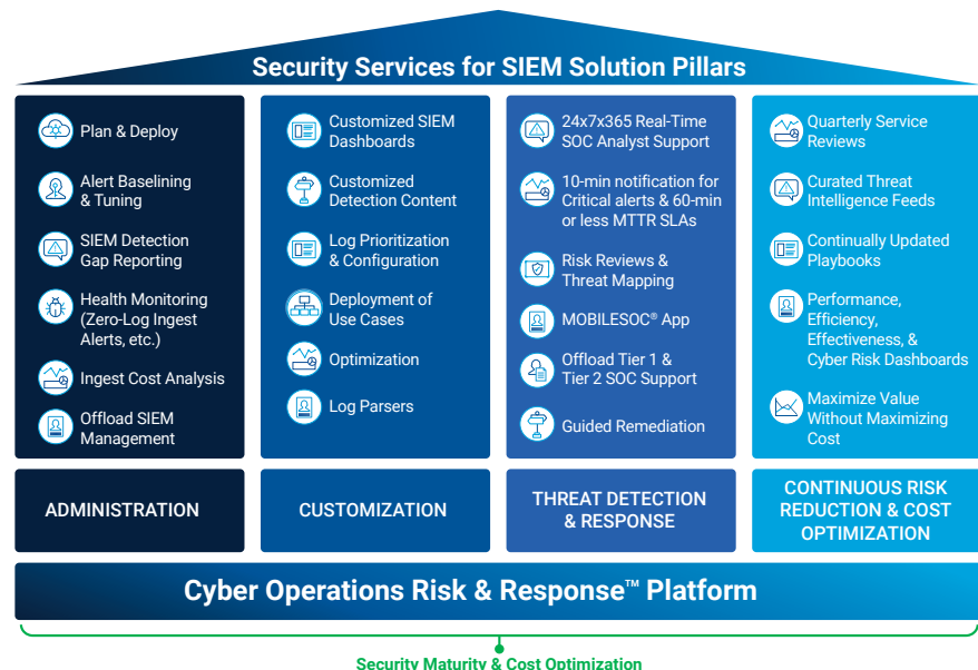
(Fig 1) The most cost-effective way to stop business disruption

Customizable dashboards and transparent reporting provide visibility into activity trends, system health, team productivity, and compliance. By integrating leading SIEM platforms like Microsoft® Sentinel , Splunk Cloud™ , Splunk ES , and Sumo Logic® with our purpose-built Trusted Behavior Registry® (TBR®), our proprietary Cyber Operations Risk & Response™ platform , and human-driven MDR, Critical Start reduces complexity and risk while maximizing the value of your security resources. (Fig 1)